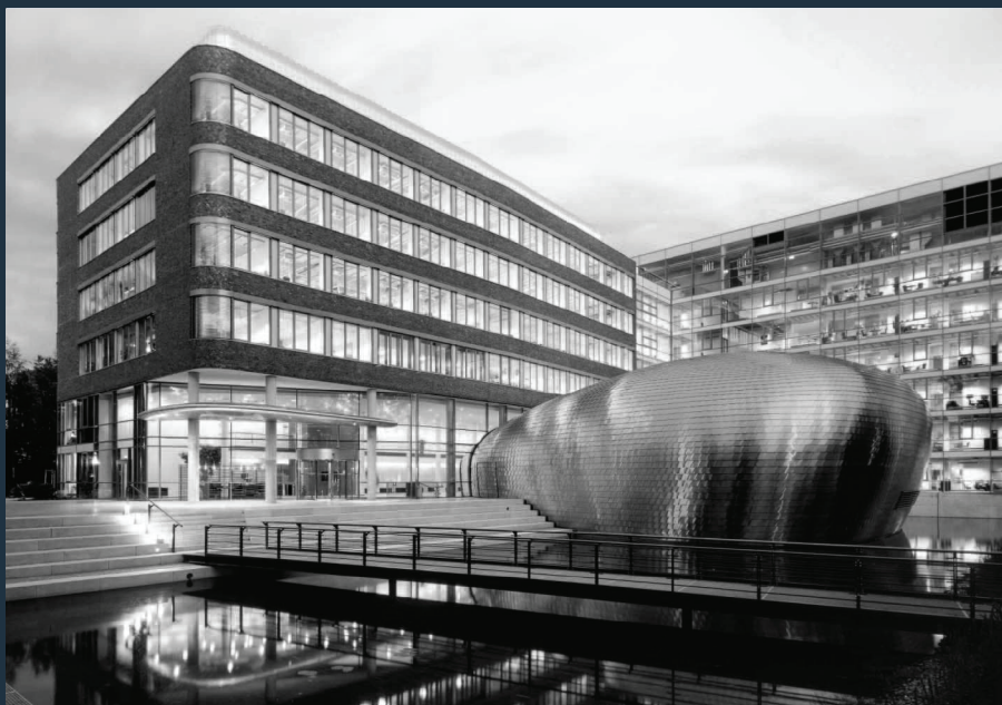
TOP: In the Research & Development laboratory, BOTTOM: Beiersdorf AG, Research Center Hamburg